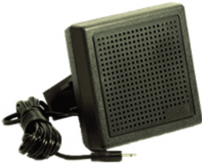
SP207 High Performance Speaker Dealer's Price: $19.95