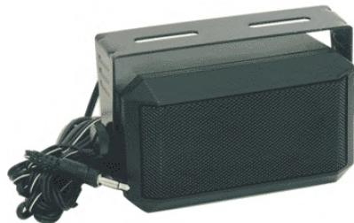
SP321 Small Performance Speaker Dealer's Price: $16.95