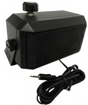
SP321A Small Performance Speaker with Volume Control Dealer's Price: $23.95