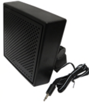
SP217 Economical Speaker Dealer's Price: $17.95