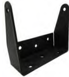
BR207 Metal Bracket for SP207 speaker Dealer's Price: $7.45