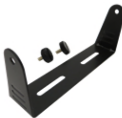
SP321B&S Bracket and Screws for Small Performance Speaker Dealer's Price: $4.00