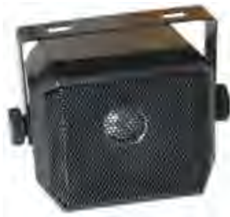
SP311 Miniature Speaker Dealer's Price: $9.95